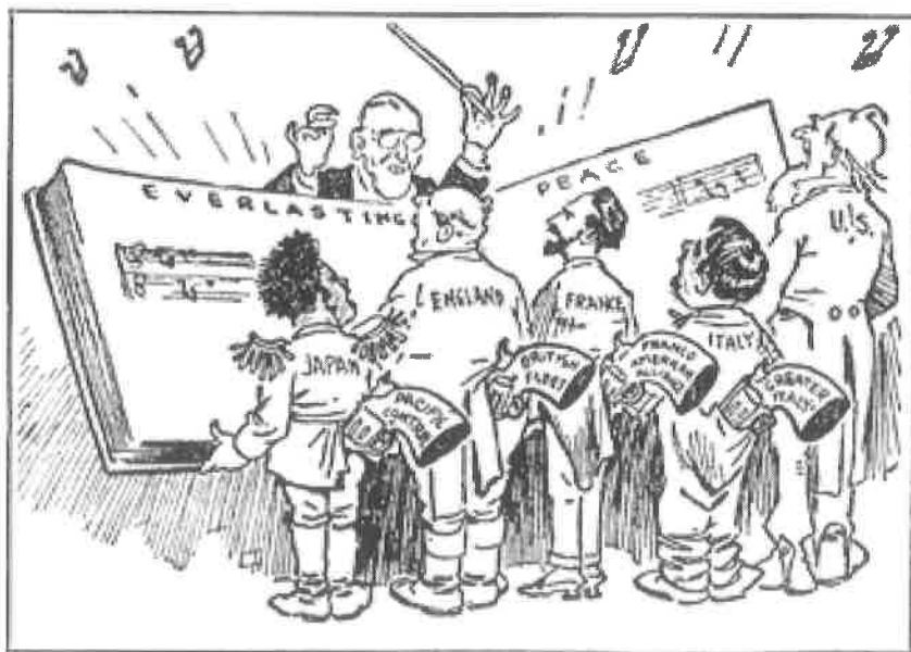
Wilson tries to get many nations to sing along.

When the Big Four summoned German officials to read the surrender terms in late May, the Germans balked when they saw that the terms contained few of Wilson's original Fourteen Points. Feeling betrayed, they hesitated before agreeing to the terms, but signed after the Allies threatened to resume the war if they failed to comply.